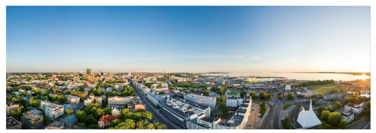
Campus | Tallinn University (tlu.ee)

Our address is Uus-Sadama 5 (Mare building) / Narva mnt. 29 (Astra building), 10120, Tallinn, Estonia