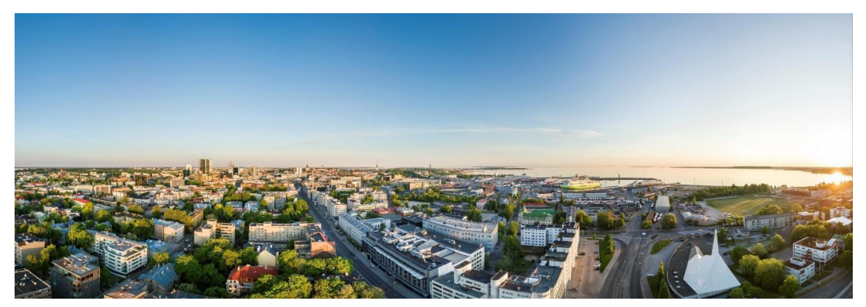
Campus | Tallinn University (tlu.ee)

Our address is Uus-Sadama 5 (Mare building) / Narva mnt. 29 (Astra building), 10120, Tallinn, Estonia