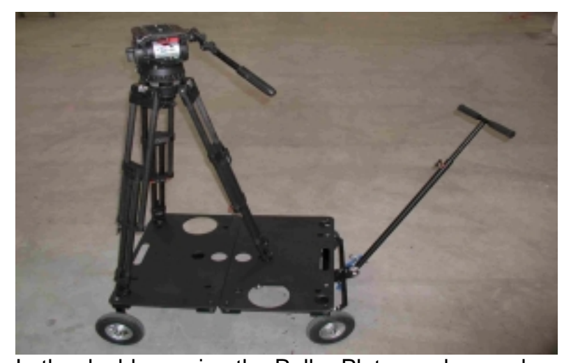
In the double version the Roller Plate can be used as a base for any conventional tripod. Just fit the legs into the moulds.