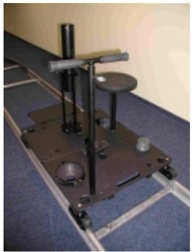
The steering rod of the Tire Set can also be used as a Push rod. Just place it into one of the seat mount holes.