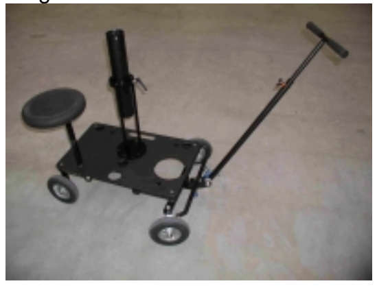
Singel Roller Plate